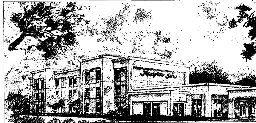
ON THE DRAWING BOARD — An artist's rendering of the Hampton Inn property open in Fairmont in summer 2009.

For more information, visit www.torgersonproperties.com